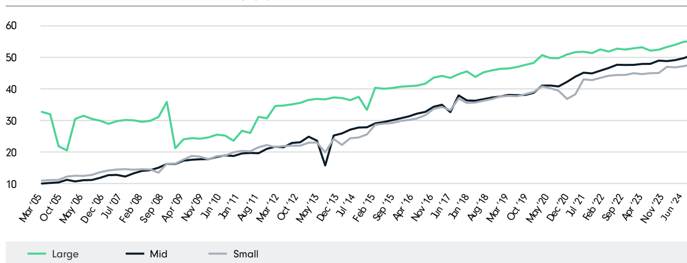
Exhibit 1 – Growth of Passive in Small Cap (%)